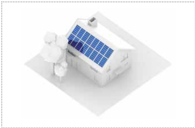
Partial shading: One MPP tracker per module ensures optimal energy production, even with dynamic shading.