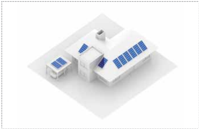
Optimal use of roof surface: Complex roof configurations can be used to maximize system output without impacting the rest of the system.